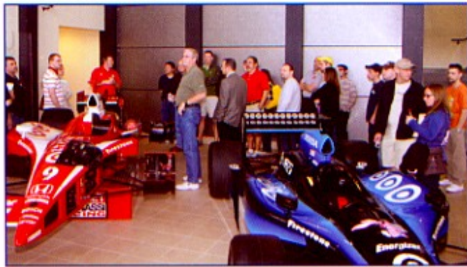
The contestants enjoyed a tour of Chip Ganassi Racing.

Tricks for Machinists, Welders and Fabricators,” as well as a replica Collectors’ Edition of the first-Machinery’s Handbook—originally published in January 1914, donated by Industrial Press Inc. in New York, N.Y.